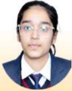
AARDHAYA TAK 97.2% HINDI (95)