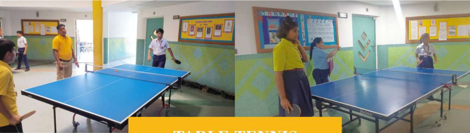
TABLE TENNIS COMPETITION

Table tennis is an exemplary game that involves quick movements, and players must have the necessary skills to be in a position to make the movements. An Inter House Table Tennis competition was organized for the students of classes VI to VIII from 10 July 2023 to 13 July 2023 for both boys and girls. In Class VI girls' category, Empathy house stood First, whereas in classes VII and VIII Integrity house secured the First position.